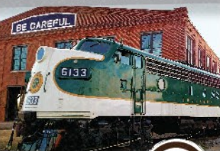
B BACK SHOP Built in 1905, this building showcases railroad, auto/trucking, and aviation exhibits.