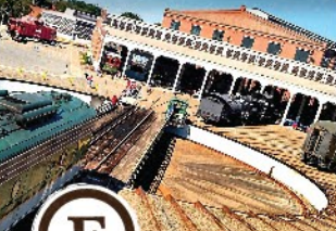
F ROUNDHOUSE & TURNTABLE Built in 1924 for steam locomotive maintenance and repair. Houses locomotives and railcars; rail and aviation exhibits, including a 1903 Wright Flyer replica. Turntable rides available and site orientation video.