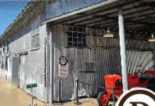
D STOREHOUSE NO. 3 This 1896 structure is the oldest on site. Open on select days.