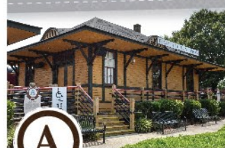
A BARBER JUNCTION Authentic 1898 railroad depot Visitor Center, ticket purchase, check-in, and train ride boarding.