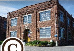
C MASTER MECHANIC'S OFFICE Built in 1911, this building houses the Gift Station and rotating exhibits. Museum admission tickets available in Gift Station.