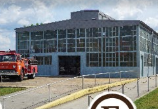
E FLUE SHOP Built in 1924, this building is home to the Bumper to Bumper auto exhibit.